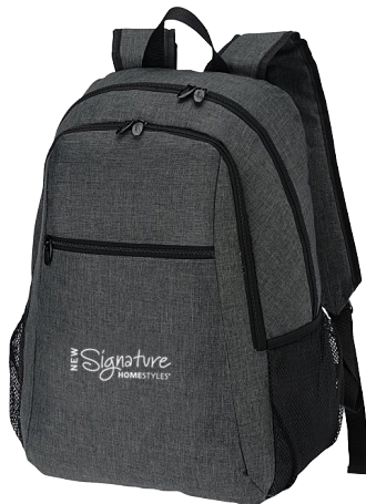
15" Laptop Backpack, Grey 18,000 Points