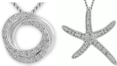
Galaxy Necklace 25,000 Points