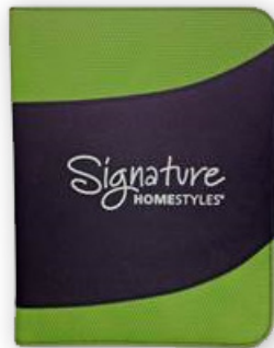
Directors receive a Signature HomeStyles Logo Padfolio ($30 value).