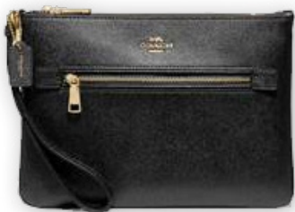
Executive Directors receive a Coach Purse ($175 value).