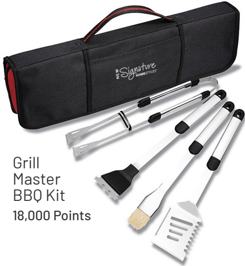
Grill Master BBQ Kit 18,000 Points