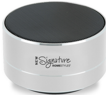
Bluetooth Speaker, Silver 6,000 Points