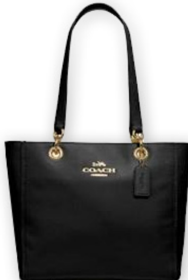
Senior Executive Directors receive a Coach Tote ($250 value).