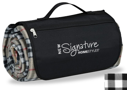
Picnic/Stadium Blanket, Black and White Plaid 12,000 Points