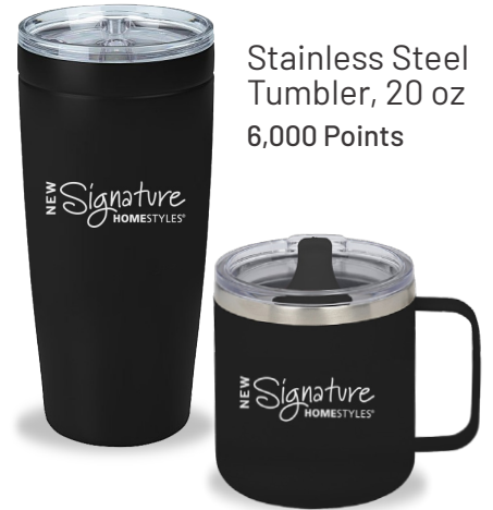
Stainless Steel Tumbler, 20 oz 6,000 Points