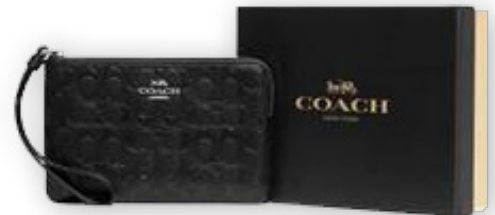
Senior Directors receive a Coach Wristlet ($70 value).