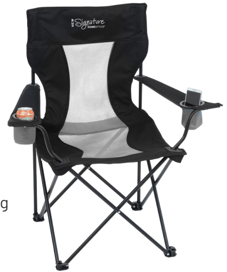
Mesh Folding Camp Chair 18,000 Points