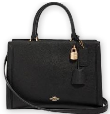
National Directors receive a Coach Bag ($400 value).