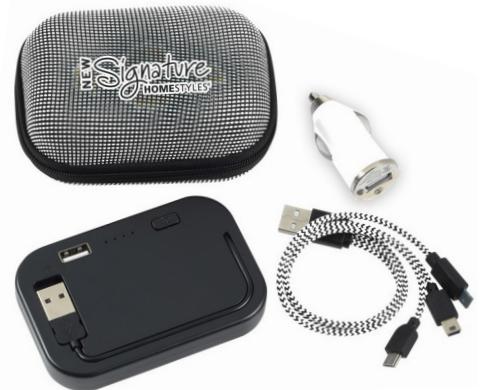
Ultimate Tech Charging Kit with Power Bank 12,000 Points