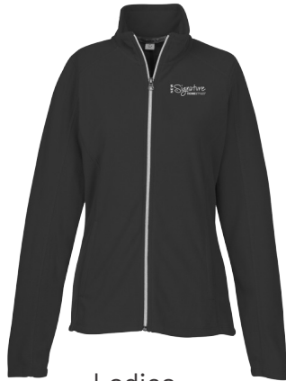
Ladies Crossland Microfleece Jacket 18,000 Points