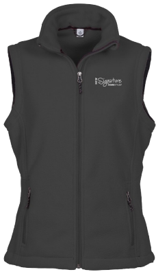
Ladies Crossland Fleece Vest, Black 18,000 Points